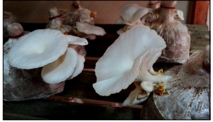
Some pictures of Mashroom unit