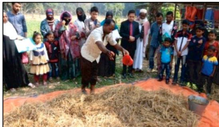
Practical session on machine milking, preparing urea molasses straw (UMS) and silage during visit to BARD demonstration dairy farm

As of December 2018, the "Mushroom Development and Cultivation Centre" of BARD has made about 1000 commercial spawns and 100 mother spawns. During the reporting period about 10 kg. of mushroom have been harvested from the centre.